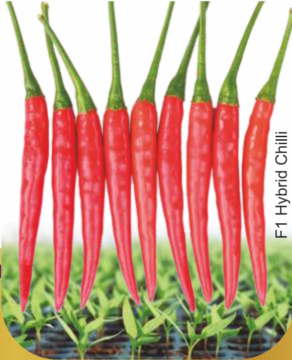
F1 Hybrid Chilli