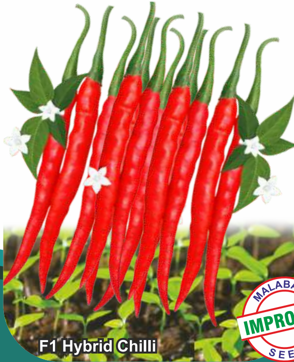
F1 Hybrid Chilli