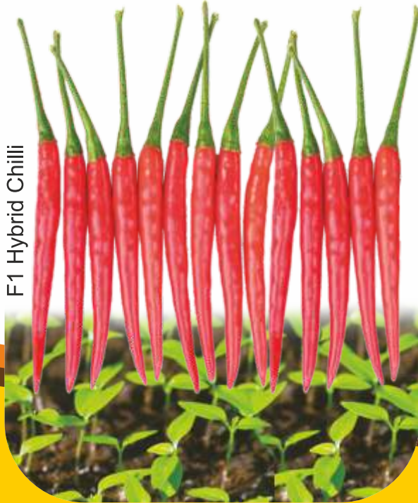
F1 Hybrid Chilli